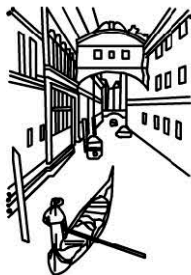
Riding a gondola in Venice