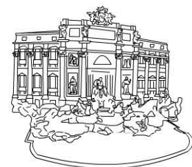
Fontana Di Trevi