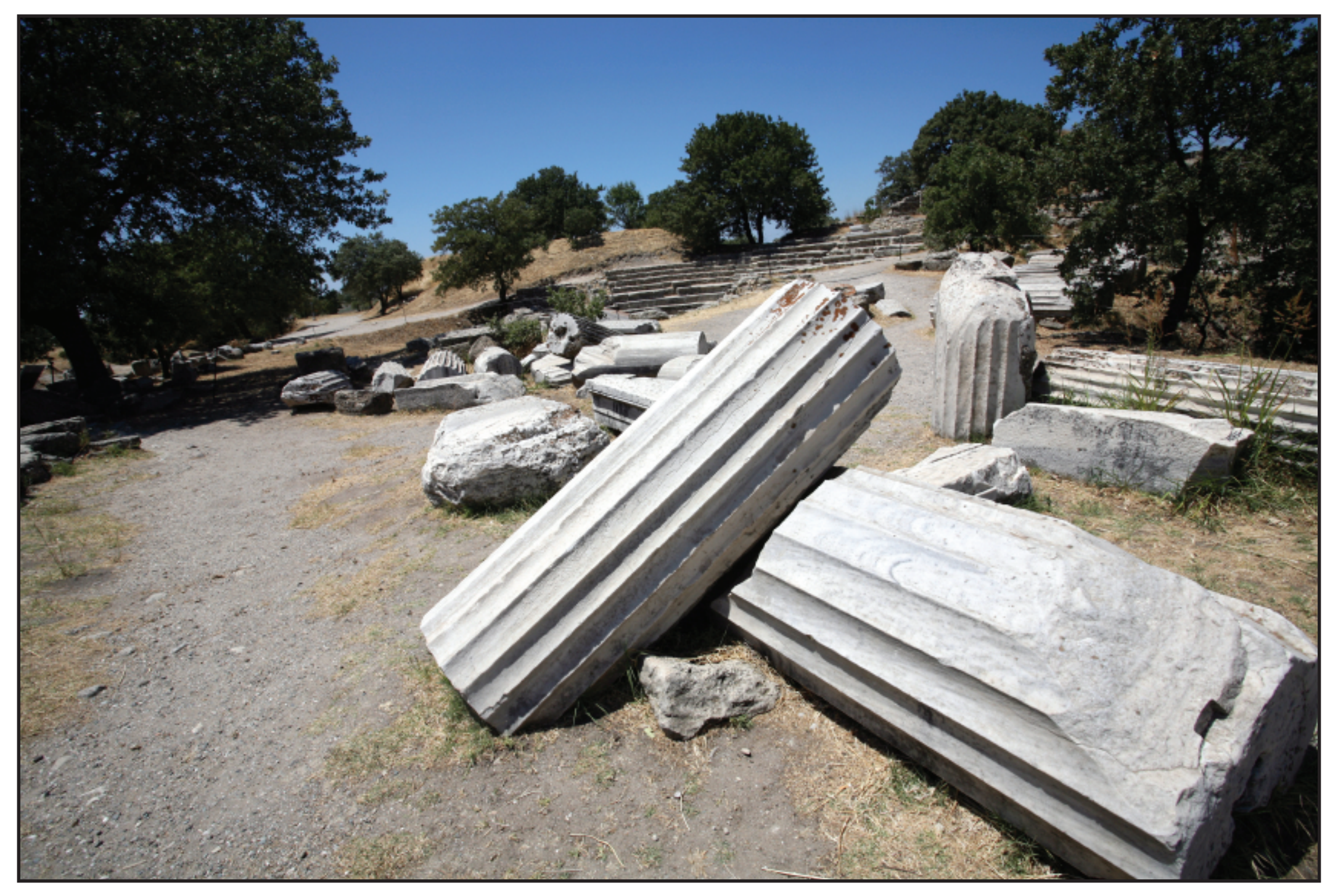
Ancient City of Troy, Çanakkale Province, TURKEY