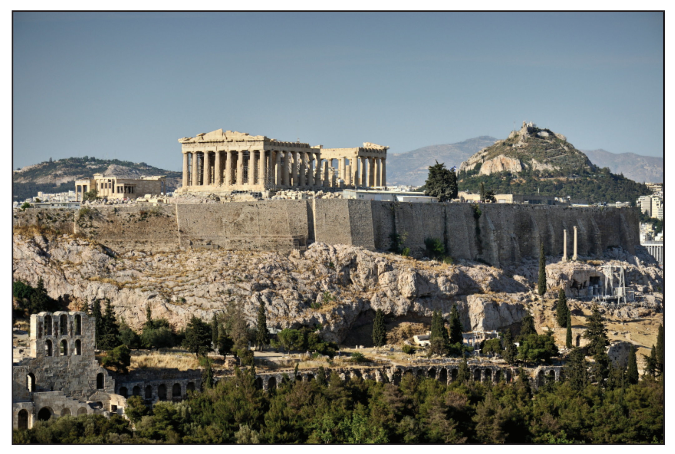
The Acropolis, Athens, GREECE