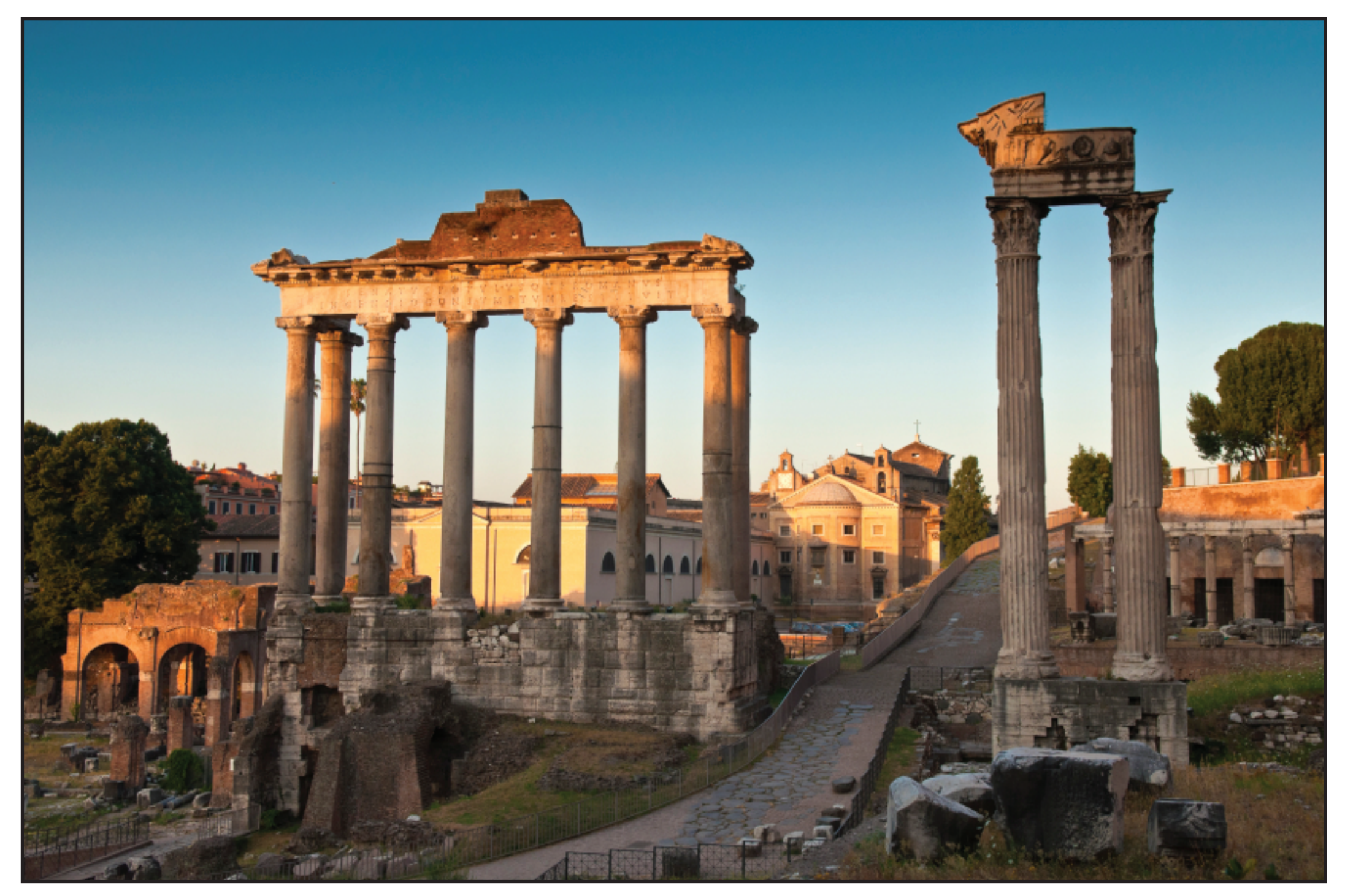
Roman Forum, Rome, ITALY