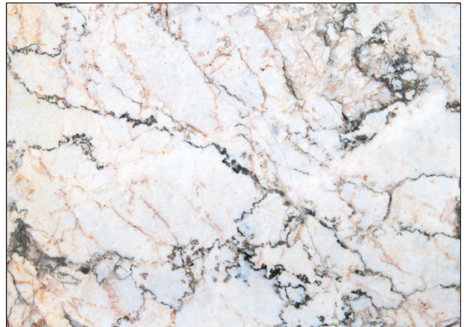
marble (metamorphic rock)