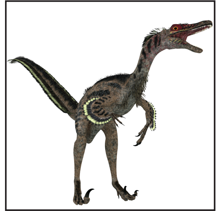
Artist's impression of a feathered velociraptor.

Fossilised velociraptor specimens have been found in Mongolia. They are thought to have lived in the Later Cretaceous Period about 75-71 million years ago.