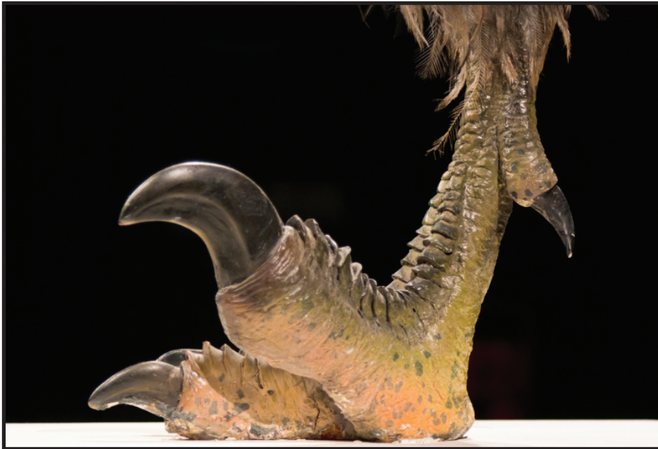
A scientific reconstruction of the foot of a velociraptor