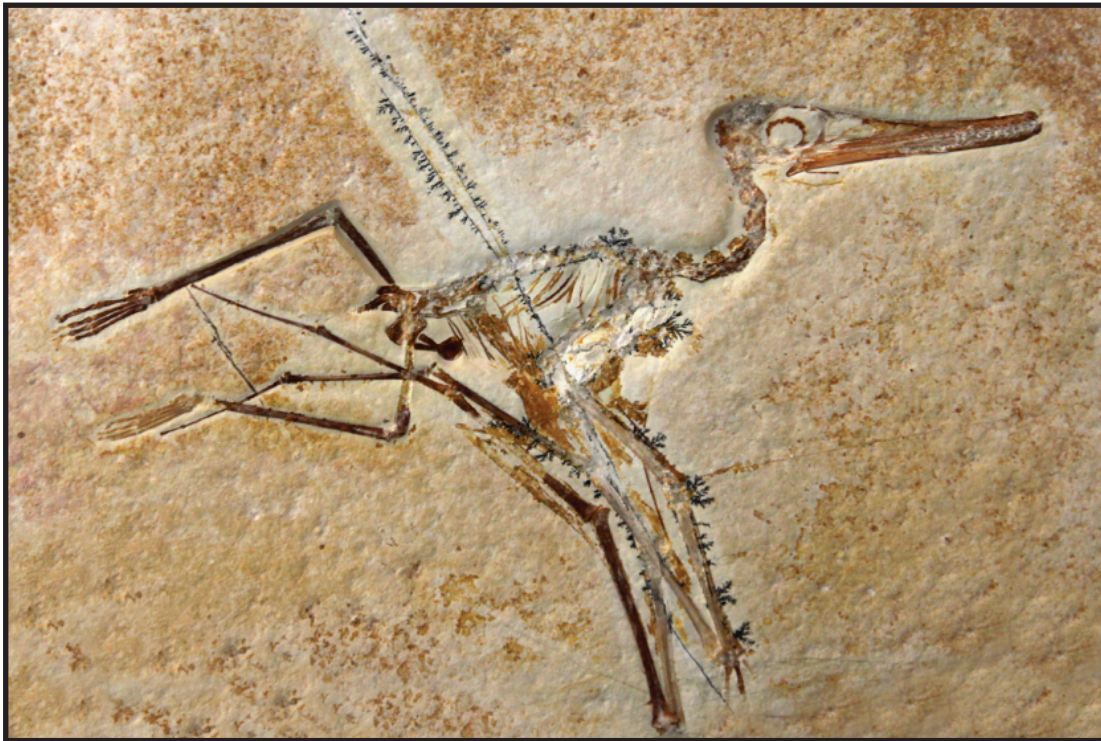
Fossil of Pterodactylus Elegans that lived 148 million years ago.

Like modern day bats, they had strong membranes between their elongated fourth fingers and their hind feet, which enabled them to fly. They had long, thin skulls with many conical shaped teeth that helped them grab and hold on to small prey. They varied in size and some had bony crests on the top of their skulls.