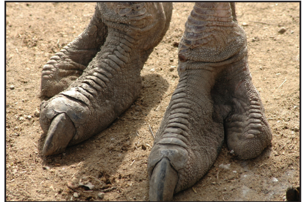
Feet of an ostrich, a current day flightless bird.