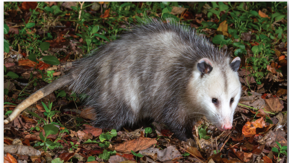
North American Opossum. The only marsupial species native to North America.