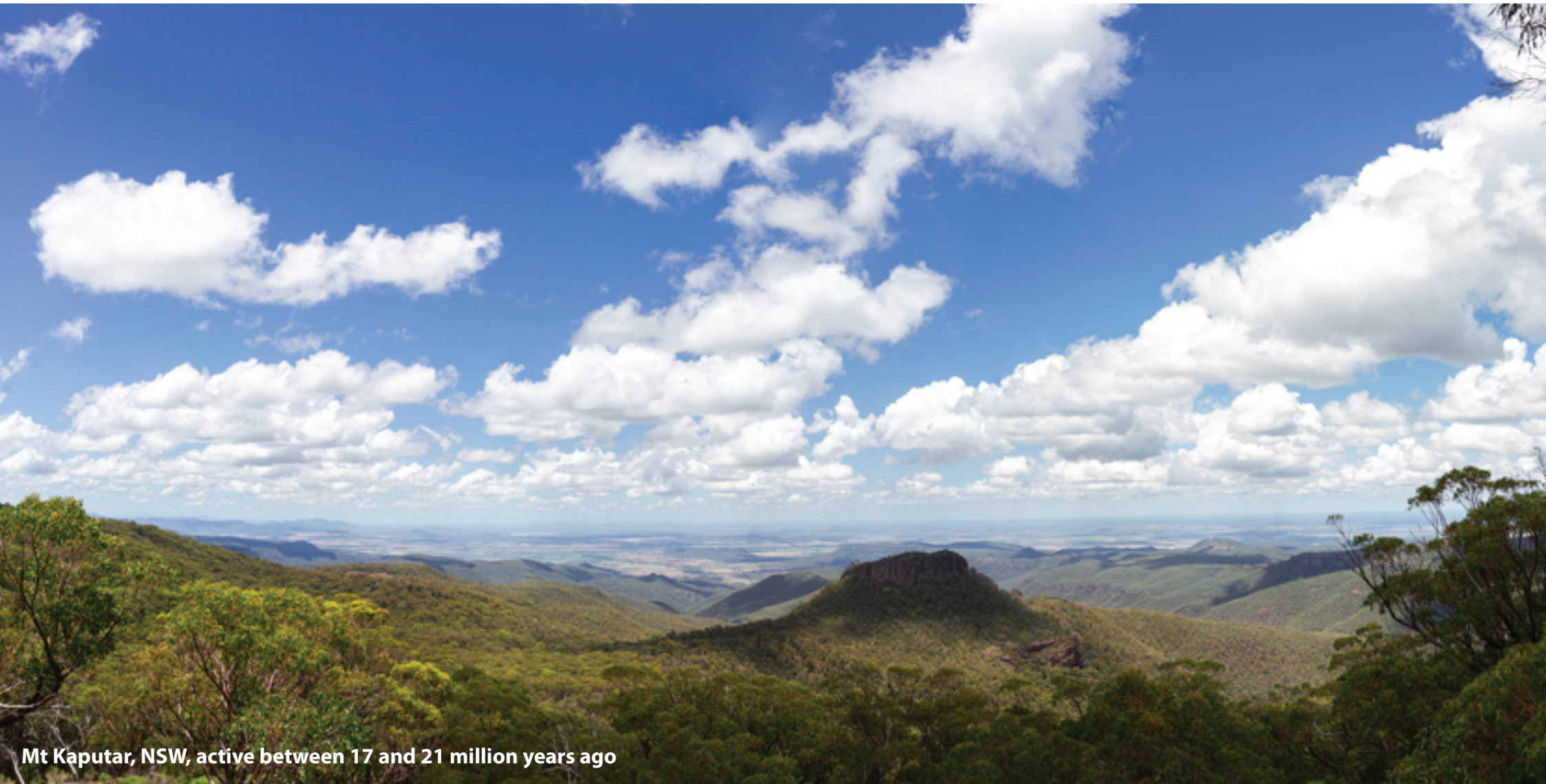
Mt Kaputar, NSW, active between 17 and 21 million years ago