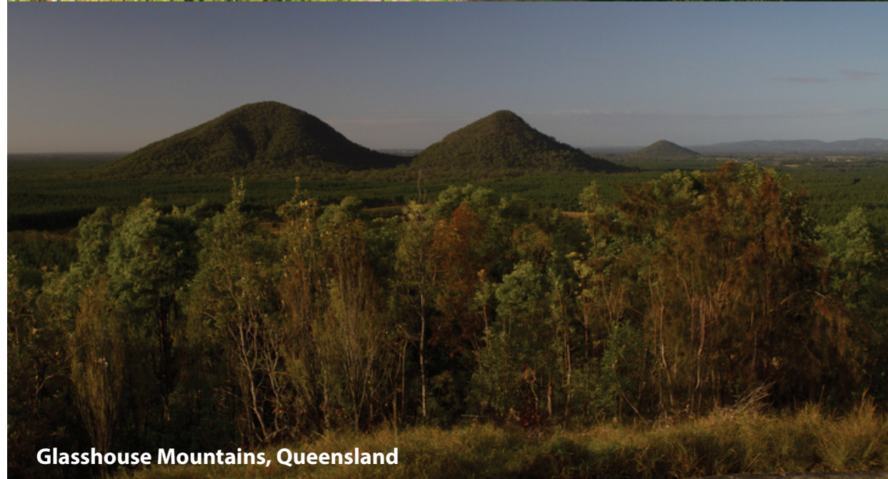
Glasshouse Mountains, Queensland