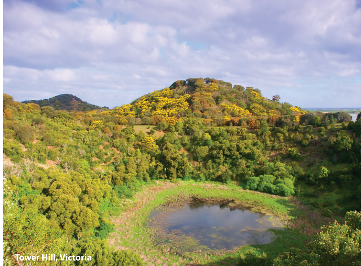
Tower Hill, Victoria

Who knows... maybe those tree covered hills you can see are extinct volcanoes!