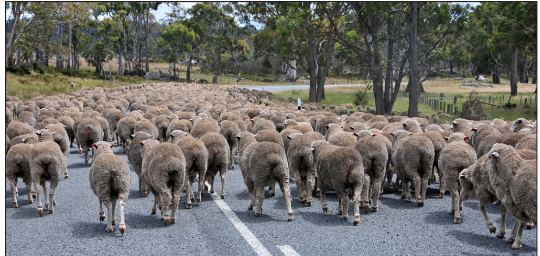
European settlers hunted thylacines to protect their farming interests. The Government at the time offered a cash reward for every thylacine killed.